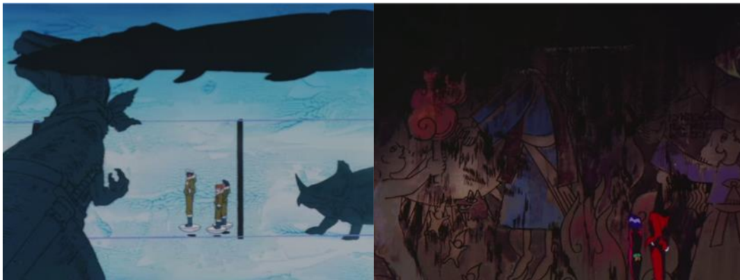
Left: Nemo takes Jean and Nadia on a tour of his Antarctic base. Right: Gargoyle takes Nadia through records of Atlantean history aboard Red Noah.

perpetrator father, as Gargoyle, adopting a paternal attitude, attempts to induct her into Atlantean culture as princess. In a scene that parallels Nemo's tour of the Antarctic base, Gargoyle takes Nadia through a history museum onboard the ship; however, this sequence reveals the darkest aspects of the Atlantean past, likely alluding to Unit 731, as she bears witness to genetic engineering laboratories containing the grotesque remains of ancient experiments in which humans were first created. Nadia furiously resists identification with Gargoyle, disavowing any affiliation with the Atlantean legacy and its associated perpetrator trauma.