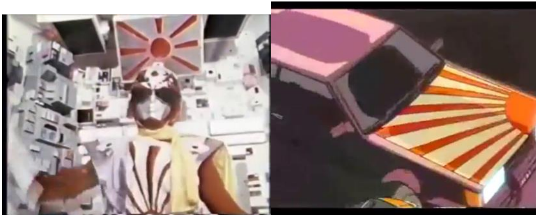
Left: the giant mecha 's interior in "Dainippon". Right: the hooligans' car in MADOX-01 .

same time, the film hints at a critique of nationalist nostalgia: at one point during the chase, a group of hooligans approach the MADOX in a car sporting the Rising Sun flag on its bonnet, with which they deliberately cause a roadside crash. As in the anime discussed in Chapter 2, there is an ambivalence towards Japanese military empowerment.