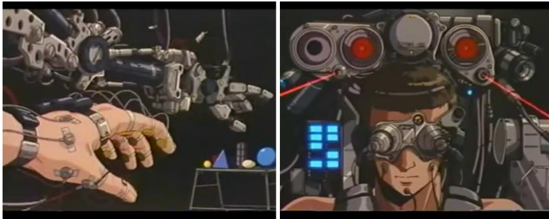
Opening sequence of MADOX-01 . Anno's animation emphasises the physical power granted by technological enclosure, which his directorial works complicate with themes of trauma and alienation.

It is here that a contrast emerges between Miyazaki and Anno. Lamarre argues that unlike Laputa's animatic illusion of depth, Nadia presents flattened panoramas which resemble schematic diagrams that contrast Miyazaki's painterly backdrops ( The Anime Machine , 159-160). This flattening of layers removes the sense of separation between character and background, creating a sense of space "without a preestablished frame of reference" (161-162). Instead, Anno rapidly moves new visual elements into, often through high-speed editing (162). Miyazaki's animations produce character movement "relative to a preexisting depth", presenting nature as an "absolute or universal" frame of reference (166). Conversely, Anno's animation in Nadia "works with relative depth and relative movement", such that "our sense of what is inside and outside becomes thoroughly relative", blurring the boundaries between the objective world and characters' subjective perspectives. Editing and flattened composition take precedence over the compositing of layers (162). Thus, nature no longer provides an objective frame of reference, and the lines between nature and artificiality are thoroughly blurred: environments can be manufactured, just as the humans in Nadia turn out to have been engineered by ancient Atlanteans. As the series progresses, it becomes clear that most environments are artificial, and clear boundaries between nature and technology break down (167).