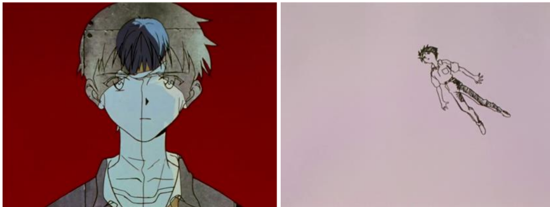
Left: Shinji's face becomes a frame within which his past observations are projected, reflecting his need to define his identity in relation to the Other. Right: Shinji in limbo (the cover image of Murakami's Little Boy ).

from the series. Shinji himself thus becomes a relative frame of reference onto which flattened images are projected. As the sequence progresses, his psychological deterioration is mirrored by the dissolution of image composition until all that remains is a sketch of Shinji floating within a white void, which Murakami reproduces this on the cover of his Little Boy catalogue: Shinji's inability to define a stable identity or place in society epitomises Murakami's psychological reading of post-bubble Japan. The sketch then unravels into a series of abstract lines that dissolve and recombine in different forms, symbolising the complete dissolution of Shinji's ego.