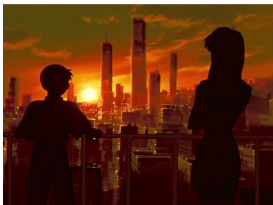
Shinji and Misato watch as Tokyo-3's skyscrapers emerge from the ground at sunset.

ruins of Tokyo were turned into a thriving metropolis. In the wake of Second Impact, the Earth-shaking apocalypse caused by contact with the Angels, Japan constructs the city of Tokyo-3 near the headquarters of NERV, the organisation tasked with defeating the new apocalyptic threat. While many parts of the world are implied to remain in extreme poverty, Tokyo-3's residents enjoy access to modern consumer comforts a mere fifteen years post-disaster. Anno's detailed rendering of the setting reflects the optimism of Japan's Economic Miracle, in which the trauma of defeat was partially overcome through scientific innovation and booming mechanical industries. This ethos is highlighted during the second episode when Misato Katsuragi, Shinji's new guardian and military commander, takes him to a hilltop overlooking the Tokyo-3 area. The entire cityscape is empty, as the buildings are equipped to recede into the underground Geofront during a crisis; with Shinji's recent defeat of an Angel, skyscrapers begin to emerge, accompanied by a vivid sunset and uplifting brass music. Anno's animation paints a compelling vision of a technologically-optimised future in which the environment is engineered perfectly to meet human needs. Furthermore, this moment conveys to Shinji a rationale behind his role as an Eva pilot, as Misato shows him the urban haven safeguarded by his sacrifices.