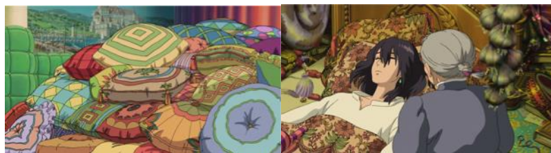
Left: Bo's bedroom in Spirited Away . Right: Howl's bedroom.

appears: forced to remain secluded in a padded room filled with toys and cushions, he has grown to monstrous size while retaining a baby's anatomy. This upbringing results in a narcissistic personality, leaving him capable of regarding others only as objects for his gratification. Bo has a character arc in parallel with Chihiro's: he too is thrust out from the safety of parental oversight, embarking on a journey to distant (pastoral) lands and maturing as he builds meaningful friendships. In the film's climactic scene, he challenges his mother's authority and asserts personal agency, implying that he may retain his independence and perhaps even develop an adult form as a result. Howl's bedroom, crammed full of plush cushions, toys, and other trinkets, bears a resemblance to Bo's, and he explains that these objects are enchanted to help him escape the Witch's prying eyes.