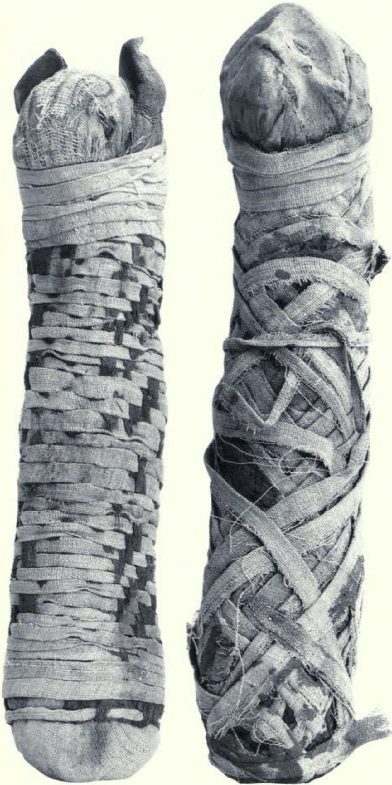
11. Cat mummies; cats. 111503 and 111512; Ptolemaic Period; neg. 71309.