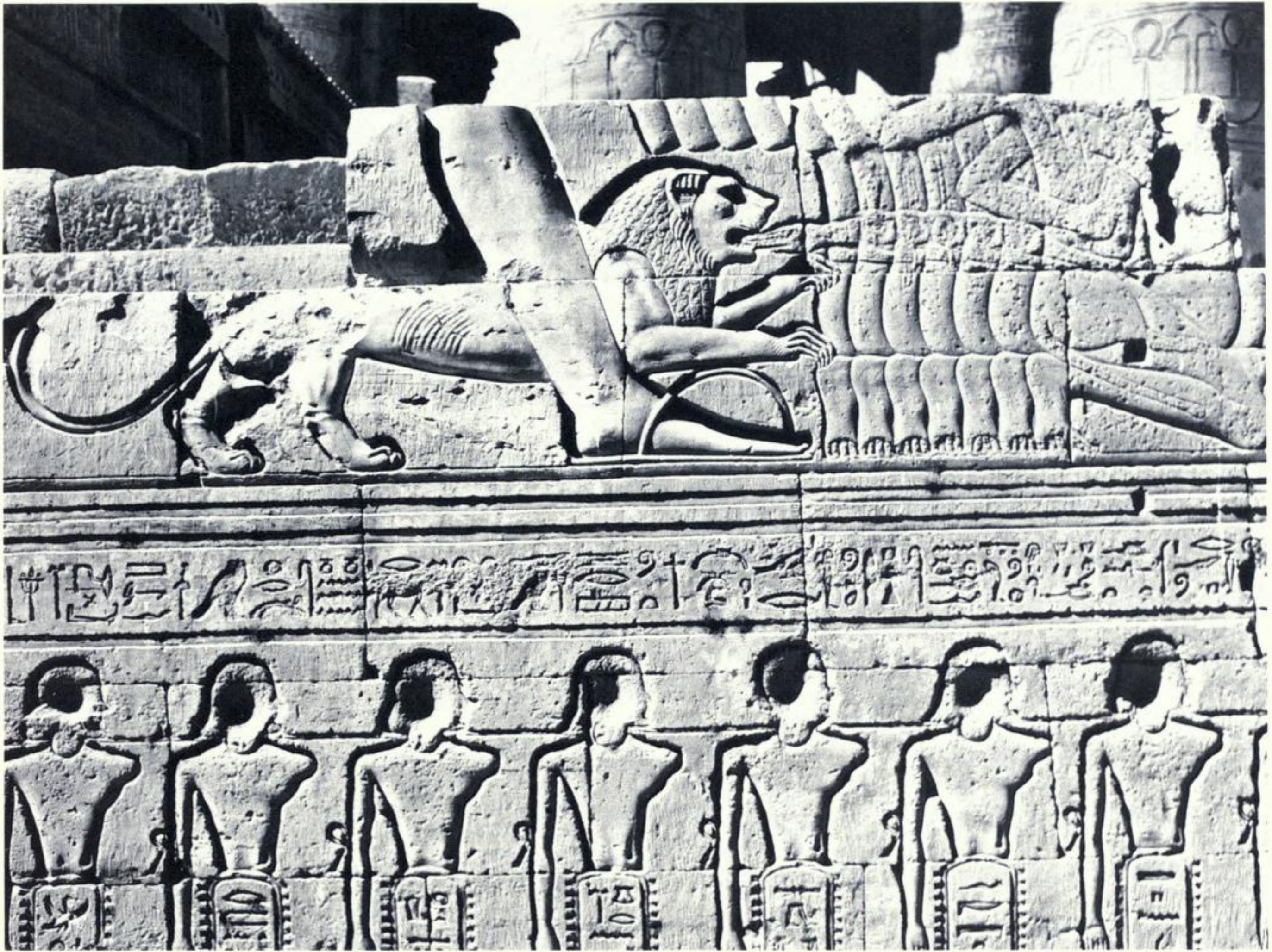
6. Miysis as a lion, mauls foes of pharaoh; wall relief, sandstone; Temple of Kom Ombo, Egypt; Roman Period.

By the Late Period (664-332 B.C.) and the subsequent Ptolemaic Era (332-30 B.C.), the sanctity of Bastet was extended to cover all domestic cats. This is demonstrated in the now-growing practice of mummifying and burying all dead cats in cemeteries attached to the various shrines associated with Bastet. Vast numbers of cats were thusly interred, at Bubastis, at Memphis (where recently the enormous cemetery adjacent to Bastet's shrine has been discovered intact with thousands of mummified cats), and at Beni Hasan (whence large numbers of mummified cats were extracted in the 19th century). 31 Most of the Field Museum's mummified cats (fig. 11) probably came from the Beni Hasan cemetery. Yet, so numerous were the cat mummies that all but the finest were unwrapped summarily. Their linen bandages were exported to the United States during the American Civil War (1861-65) to a New England factory that turned them into linen-based paper. 32 The cat mummies were shipped to