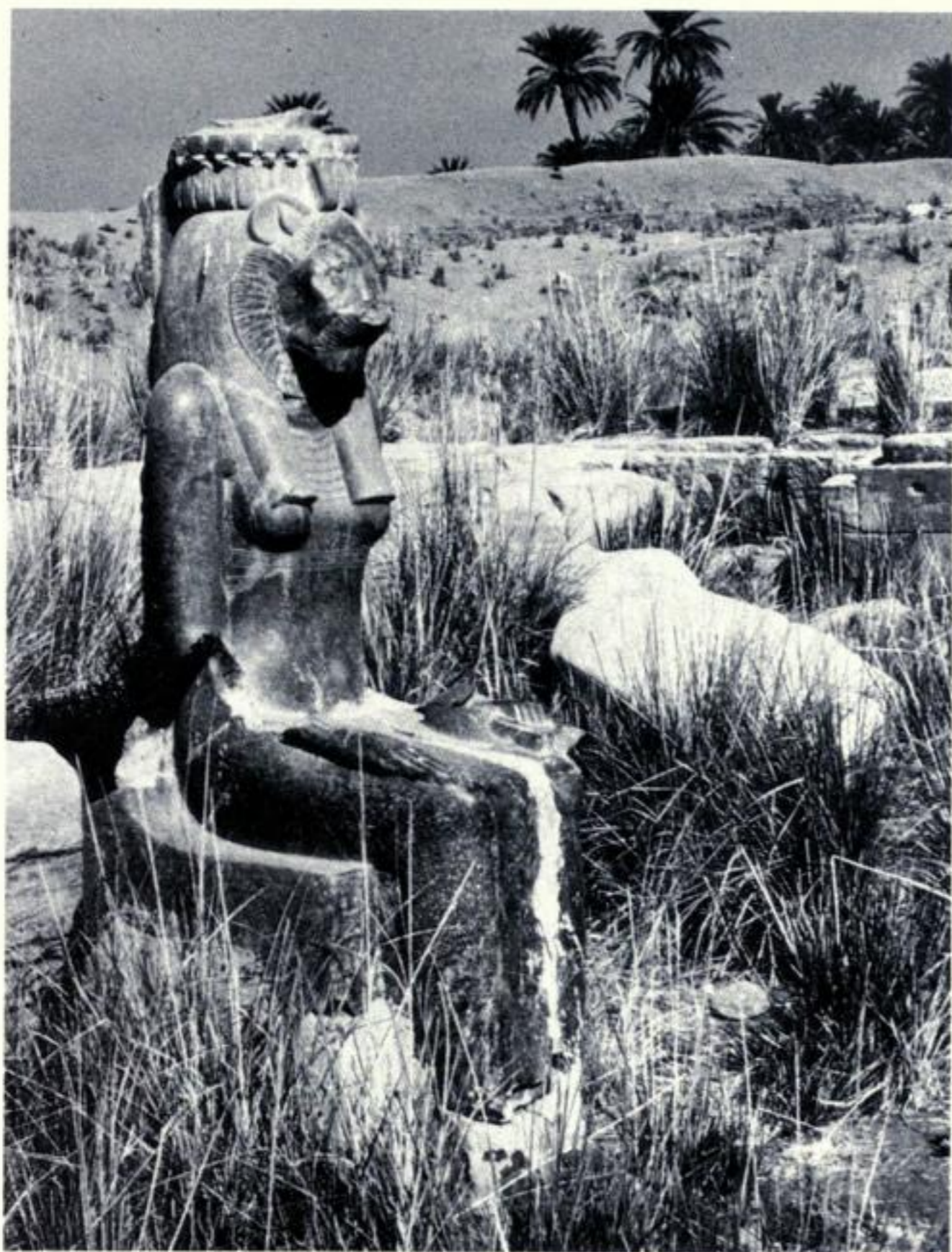
3. Statue of Sekhmet, black granite; Temple of Mut, Karnak, Egypt; Dynasty XVIII.

ancient Egyptians recognized this serpent-killing ability of the cat. Both in the funerary papyri known as Books of the Dead (chapter 17) and in tomb paintings of the New Kingdom Period (ca. 1570-1080 B.C.), a tomcat, titled as “the Great Cat who dwells in Heliopolis,” is depicted and described as cutting off the head of the dangerous serpent, Apophis, entwined around a Persea tree. 16 This tomcat, whether the short-tailed jungle cat or the domestic cat, usually is shown with a spotted coat and ringed legs and tail; he was so venerated that one of the 76 manifestations of the sun-god was represented as a tomcat (fig. 1). The ability of modern Egyptian cats to tackle vipers or other serpents lends support to the idea that the Great Tomcat of Heliopolis was indeed a domestic tomcat. 17 This aspect of the cat—the ability to tackle serpents—assured its status in Egypt, for while a cat that is a good mouser is both useful and desirable, a cat that takes on serpents can be, absolutely, a lifesaver.