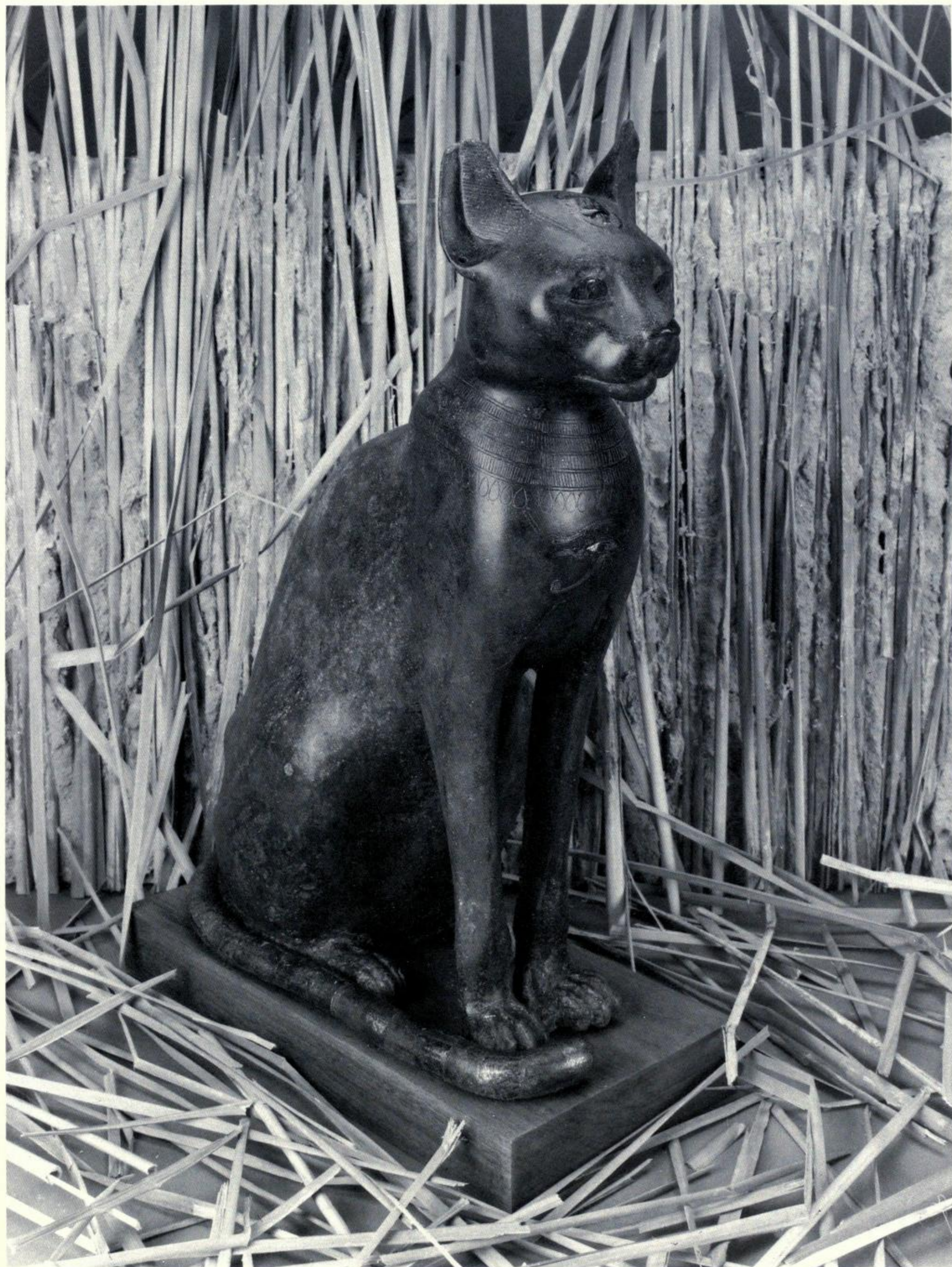
9. Bastet as a cat, bronze with gold, silver, and copper details; cat. 30286; perhaps Dynasty XXVI; neg. 111081.