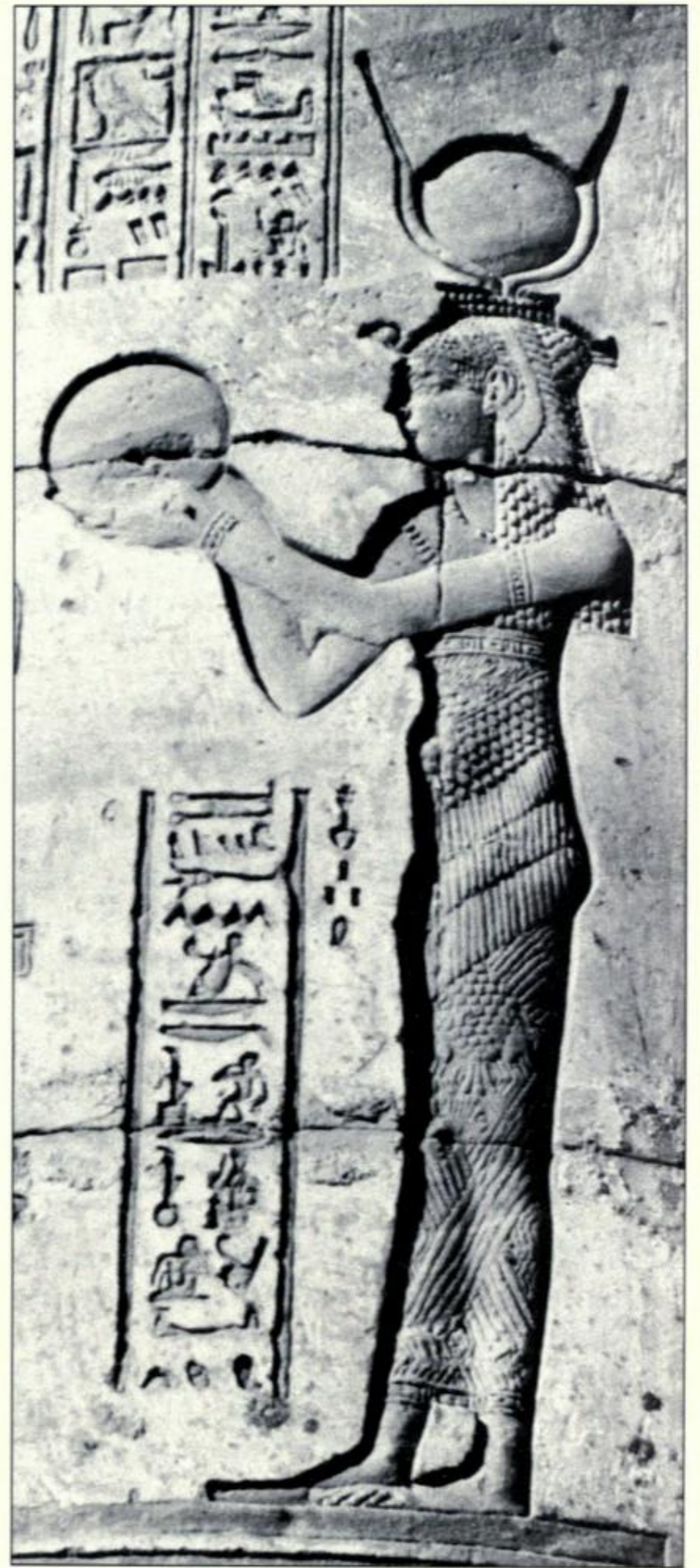
7. Above: Hathor playing castanet, column relief, sandstone; Temple of Dendera, Egypt; Roman Period.