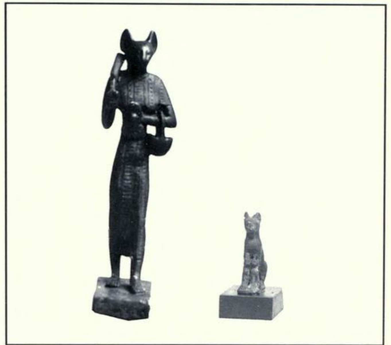
10. Left: Bastet as cat-headed female, bronze; cat. 30287; Late Period; neg. 8068. Right: Cat with kittens, votive to Bastet, bronze; cat. 30285; Late Period; neg. 1358.

fascination with the domestic cat mirrors that of ancient Egypt. 35