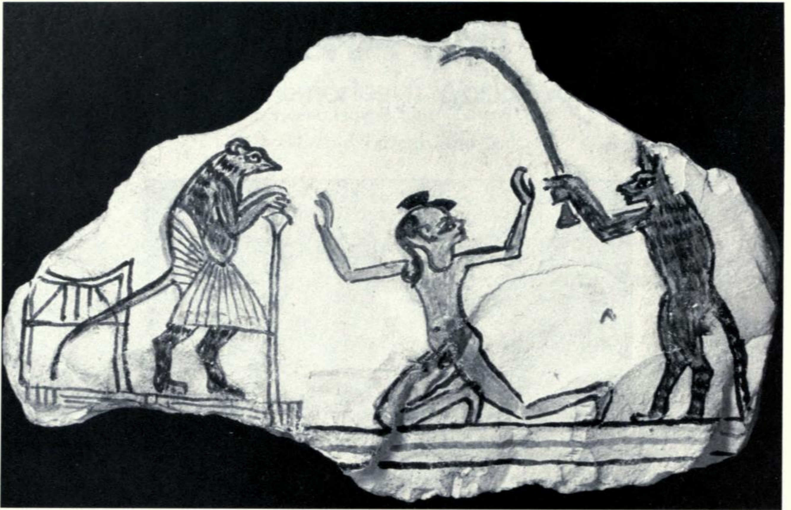
2. Cat, as bailiff, brings bad boy before mouse judge; Oriental Institute limestone ostracon, painted, no. 13951; Deir el-Medinah, Egypt; Dynasty XIX-XX.