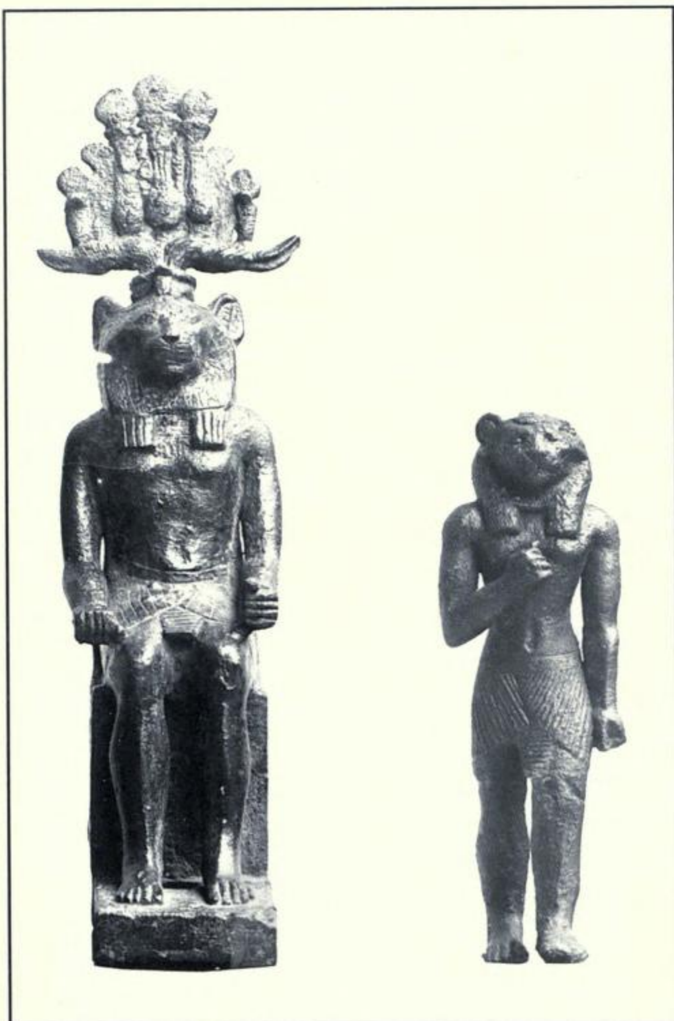
5. Miyisis, or Mahes, son of Bastet, bronze figures; cats. 30282 (left) and 30283; Late Period; negs. 8067, 8069.

Another satirical and humorous papyrus in Turin, Italy, shows cats defending a fortress under attack by a pharaoh-mouse in a chariot drawn by dogs. 22 In another scene on this papyrus, and on another in the British Museum, cats act as shepherds herding a flock of geese. 23 At the Oriental Institute in Chicago, a limestone ostrakon (fig. 2) shows a cat acting as bailiff who brings a miscreant boy into court before a mouse acting as judge. All of this suggests that the cat had secured for itself a familiar and comfortable niche in the milieu of ancient Egypt.