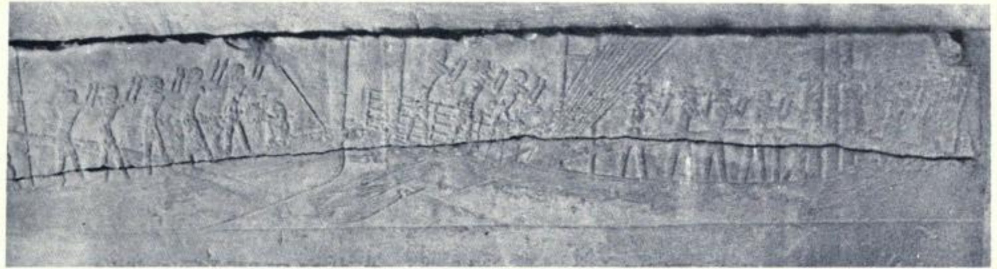
12. Egyptian ships arriving from Syria, wall relief, limestone; causeway of Unas Pyramid complex, Saqqara, Egypt; Dynasty V.