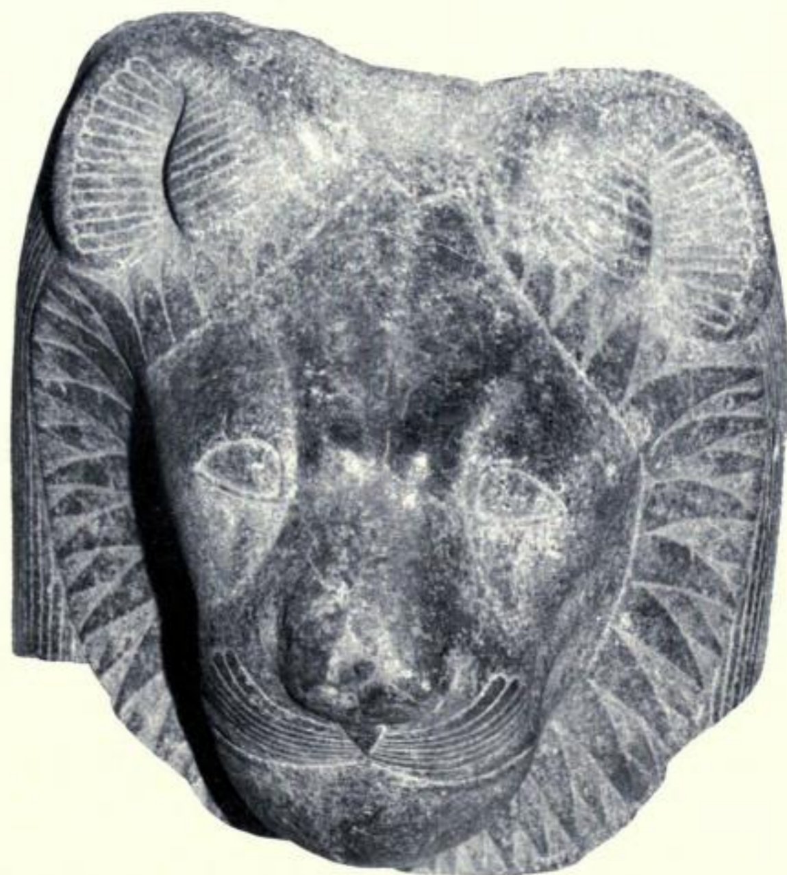
4. Head, from Sekhmet statue, black granite; Field Museum no. 31720; from Mut Temple, Karnak, Egypt; Dynasty XVIII.

skiff, 18 or else sitting or lying down under the chair of the lady of the house. 19 Its position as a cherished pet is well attested. A son of Pharaoh Amenhotep III (1386-1348 B.C.), Prince Thutmose, was so attached to his cat that when she died he had her embalmed and fitted out with a small sarcophagus (now in the Cairo Museum), complete with reliefs showing the cat and funerary texts. 20 She is called “The Osiris, Ta-Mit,” the kitty’s name evidently being simply the feminine form of miw . At the head and foot of the sarcophagus, she is under the protection of Isis and Nephthys, so that just like a human, she was envisioned as gaining eternal life through Osiris. The prince included his own titles and name, so we learn that he was the elder brother of the