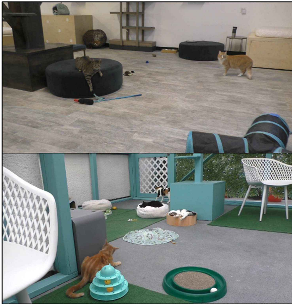
Fig. 1. Our study took place at the CatCafé Lounge. We collected data in two main areas, which include the indoor lounge (top image) and catio (bottom image). Cats can freely interact with conspecifics and humans in these areas.