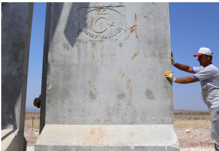
The Turkish murtaddin build a wall to prevent the muhajirin from entering Sham

Indeed, there is great blessing in hijrah. If the muwahhid but knew this, he would sell everything he owns of worldly possessions in order to purchase his salvation and seek the pleasure of Allah. ‘Amr Ibn al-‘As ﷺ said,