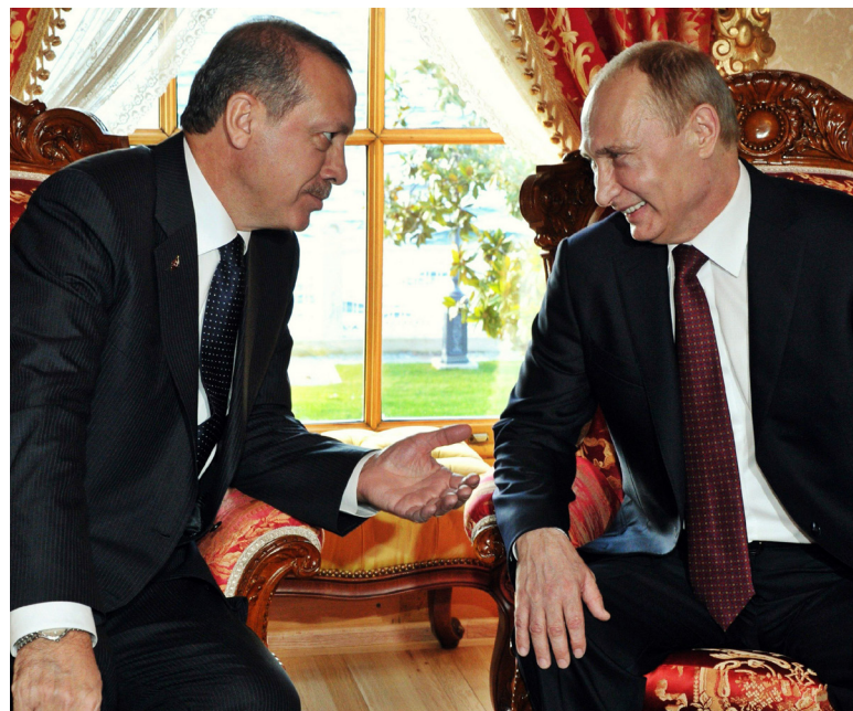
Erdogan and Putin plotting against Islam together

O knights of martyrdom and lions of jihad in Bab and its countryside! May Allah brighten your faces and reward you for your good efforts, for you have humiliated the apostates from the Turks, the Sahwat, the Kurds, and flocks of the Nusayriyyah, through your courage and your undertaking of sacrifice for your religion with honor and steadfastness. Thus, be patient, outlast your enemy in perseverance, and fear Allah, that you might be successful. Indeed, the Turkish apostate descendants of the killers of the muwahiddin today repeat the deeds of their forefathers before them. They have struck the Muslim State and the Muslim Jama’ah. Therefore, seek vengeance for your religion and tawhid.