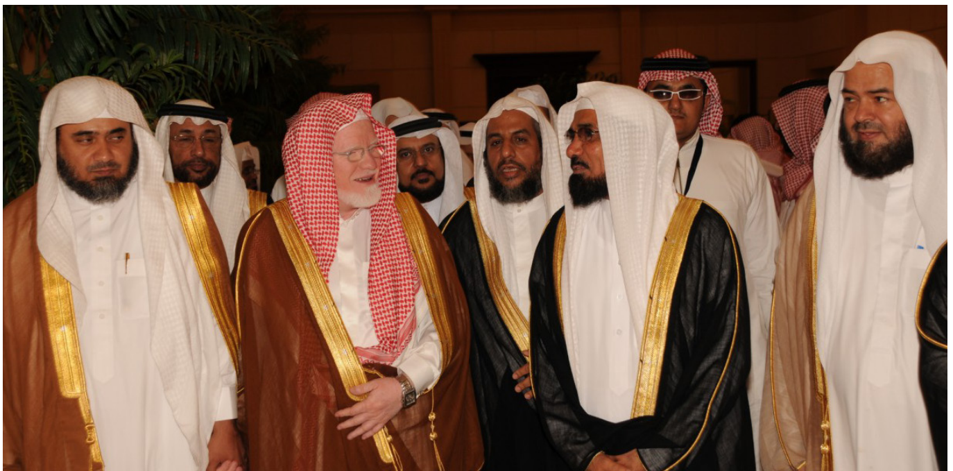
The worst creatures under the sky, deserving to be killed

By Allah, the time has come for these skulls to be split, for these souls to be smothered, and for these tongues to be cut off! 'Iyad al-Yahsibi said in his book "Tartib al-Madarik wa Taqrib al-Masalik" that "Abu Bakr Isma'il Ibn Ishaq Ibn 'Udhrah ؓ was asked about the khutbah-givers of Bani 'Ubayd, the false Fatimids. It was said to him, 'They are Sunni.' He said, 'Do they not say, 'O Allah, send blessings upon your slave al-Hakim and grant him inheritance of the earth?'' They said, 'Yes.' He said, 'Imagine if a khutbah-giver gave the khutbah, beginning with praise for Allah and His