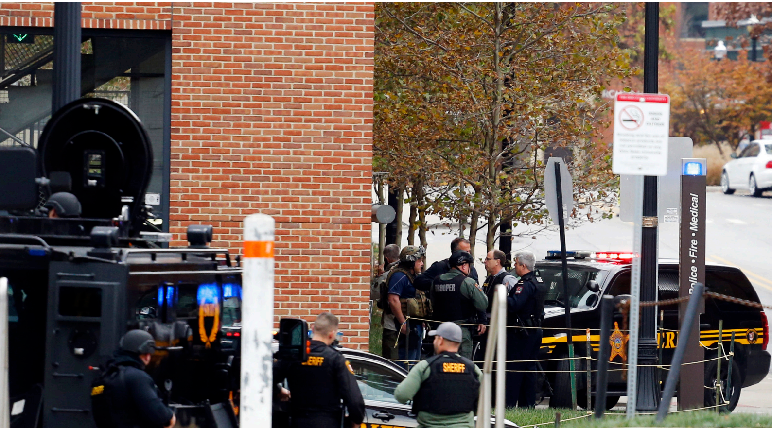
The aftermath of the attack at Ohio State University

sassinated an intelligence colonel using a silenced handgun in the city of ‘Adan.