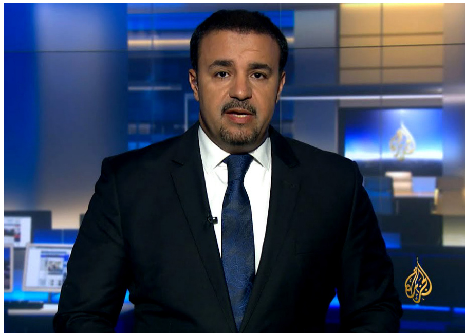
Apostate media man spreading frightful news

He ﷻ said, describing them with stinginess, "Nothing prevented their contributions from being accepted from them except that they disbelieved in Allah and in His Messenger, that they do not come to prayer except while being lazy, and that they do not spend [for Allah's cause]