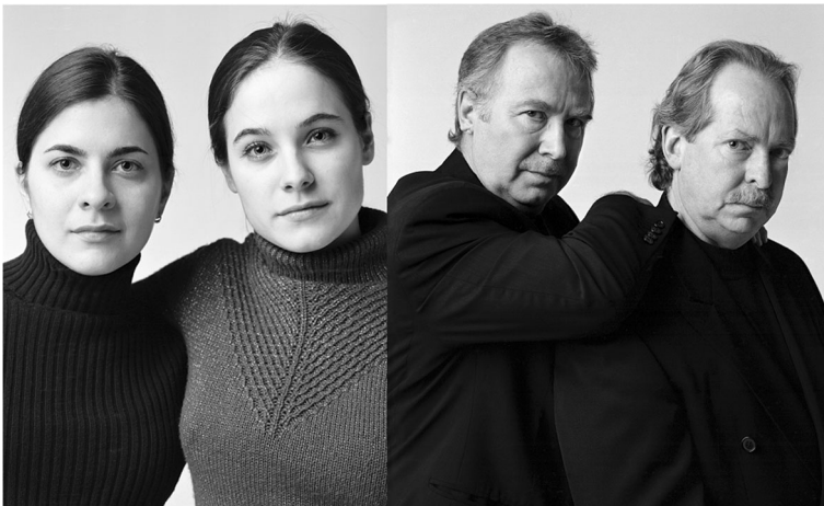
Fig. 1 Two sets of U-LA pairs.

Correlations between the Big Five personality factors from the PffPI and age and sex were generally small and not statistically significant, with several exceptions, as shown in Table 2. Conscientiousness was positively, but modestly, associated with age ( r = .23 , p < .05 ) and sex ( r = .23 , p < .05 ), whereas emotional stability correlated negatively with sex ( r = -.34 , p < .01 ). Within-pair differences in personality scores were unrelated to the within-pair difference in age. The five factors from the NEO/NEO-FFI-3 showed mostly similar, but also some different, associations with age and sex, most notably the significant correlations between both neuroticism and openness