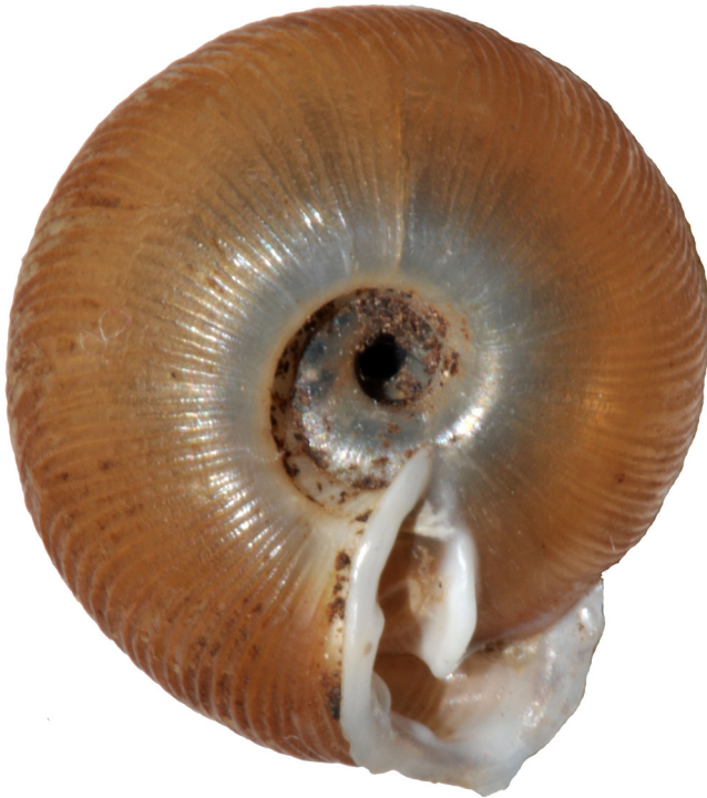
FIGURE 3 The gastropod umbilicus. The hollow space, known as the umbilicus, in the coils of some snails, as in this Polygyra from tropical Mexico, is often mentioned as representing a biological “spandrel.” A “spandrel” is understood as a “leftover” empty space amid real architectural elements. The umbilicus has been coopted in some snail species as a brood chamber, but this does not mean that it is a “part,” a trait that can respond quasi-independently from the rest of the shell to selection. This is because the umbilicus is simply a leftover space between real parts, not a part itself, again emphasizing the importance of trait delimitation in studies of adaptation

Various hypotheses have been proposed to account for the current adaptive value of orgasm in women, ranging from its ability to increase pair bonding and therefore parental care, to increasing sperm retention or stimulating ovulation (Gould, 1987; Komisaruk, 2016; Lloyd, 2005, 2013; Pavličev & Wagner, 2016; Wagner & Pavličev, 2017). All of these hypotheses generate clear predictions regarding features such as the dependability of orgasm per copulation event, the placement of the clitoris relative to the vagina, and numerous physiological responses. In all cases, support for the predictions seems weak. An alternative account, though, is consistent with all the data. It is that potent selection favors the dependability of male orgasm. Males and females share much of their early morphological development, and as a result the precursor of the penis, with its dense nerve supply and excitability, is present in both male and female embryos. Any males in which orgasm were not dependably associated with intercourse would have low mating success and thus selection favors dependable male response (see also Pavličev & Wagner, 2016; Wagner & Pavličev, 2017). No adaptive hypothesis positing current utility is able to explain why, in