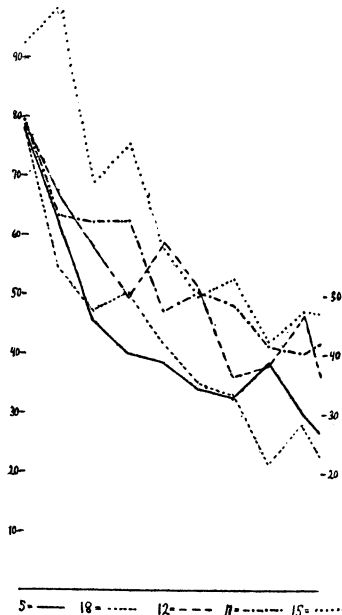
FIG. I (Continued).

In general, the earlier periods of practice show the greatest gross reduction in the scores. The graphic records of the individuals (Fig. 1) show this change.