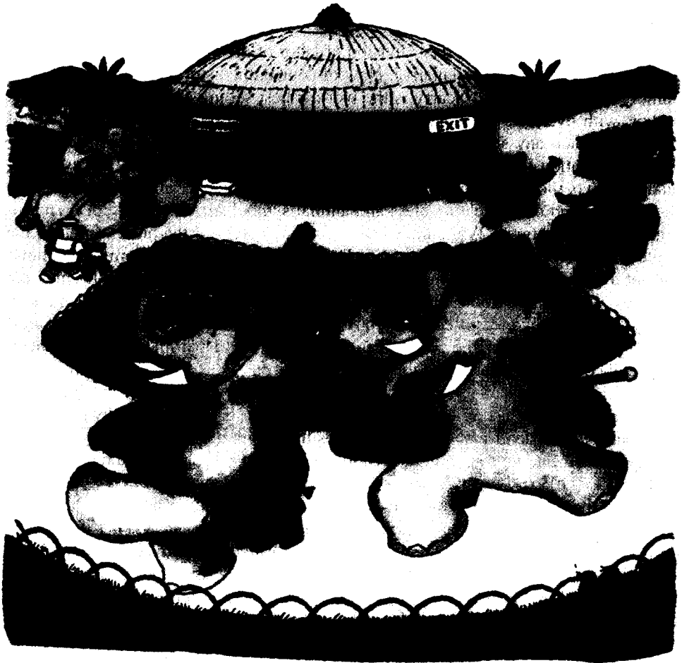
Fig. 5. From state of nature to civil society in Celesteville. (From Babar the king , by Jean DeBrunhoff, copyright 1935, 1963.) Used by the kind permission of Random House.)

And make no mistake, this differentiation is of paramount interest to DeBrunhoff. He has a long (and rather dull) description of how the division of labor works (“If Barbacol [the tailor] wants a statue for his mantelpiece, he asks Podular [the sculptor] to carve one for him, and when Podular’s coat is worn out Barbacol makes a new one”, DeBrunhoff, 1963 [1935]: 24), even down to reciprocity between the army officer who guards them from enemies, and the street cleaner who sweeps up