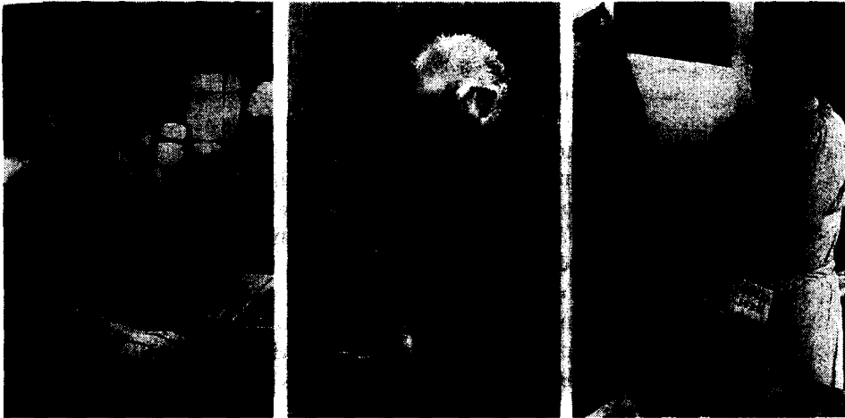
Fig. 1. The body for the job.

(Butcher picture from Pierre Bourdieu, Distinction , used by permission of Les Editions Minuit.)