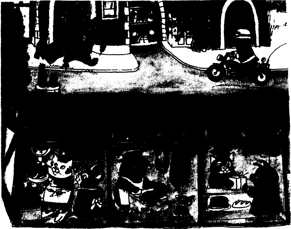
Fig. 6. The body fits the job II: A Busytown butcher.

(From What do people do all day? by Richard Scarry, copyright 1968, 1979. Used by the kind permission of Random House.)