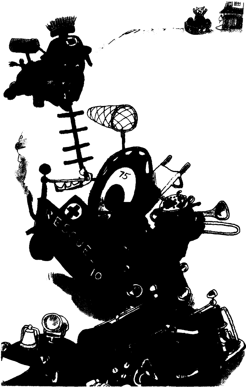
Fig. 3. Pig firemen.

(From What do people do all day? by Richard Scarry, copyright 1968, 1979. Used by the kind permission of Random House.)