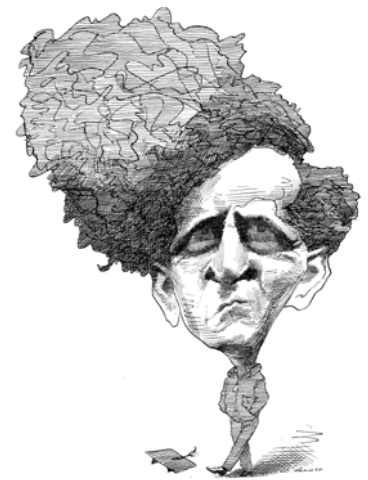
Ludwig Wittgenstein; drawing by David Levine

one of the most remarkable contributions to mathematical economics ever made, both in respect of the intrinsic elegance of the technical methods employed and the clear purity of illumination with which the writer’s mind is