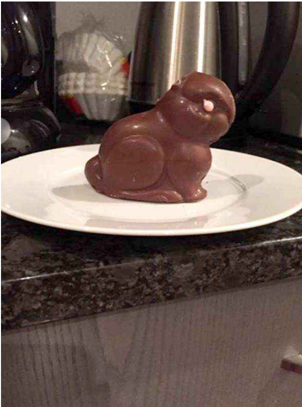
Fig. 1. Typical appearance of auricular amputation of a confectionary rabbit.

Within the current confectionary rabbit population, there appears to be seasonality to auricular amputation. Seasonality is a change in disease or condition incidence that conforms to a regular seasonal pattern (e.g., in spring or summer). 5 Previous research in the seasonal incidence of infectious diseases in humans has developed a mathematical description of the law of mass action. 6 This law states that the number of new infections (or the incidence) depends on the product of the number of infected persons, the number of susceptible persons, and the transmission parameter (or contact rate between the infected and susceptible). 7 For example, research examining measles found a decline in the incidence of measles during school holidays. This was postulated to be due to the decline in the transmission parameter (i.e., contact between children during the school holidays). 8 In the context of the current study, the number of auricular amputations among confectionary rabbits increased around Easter each year due to the increase in the transmission parameter (i.e., increase in population of confectionary rabbits coming in contact with humans). 7