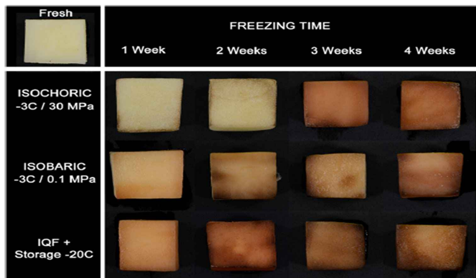
Fig. 3 Photographic images of fresh and thawed potatoes showing the onset of browning when stored under isochoric, isobaric, and individual quick freezing conditions at varying freezing times [29]

The quality of the foods can be better preserved using a constant-volume preservation technique in a closed rigid container. Potatoes when stored in isochoric refrigeration ( -5\text{ }^{\circ}\text{C} ) system immersed in 10% (w/w) sucrose solution experience no weight loss as cell integrity is maintained due to isosmotic conditions whereas in an isobaric freezing, potato at the same temperature experiences weight loss [5]. Minimally processed potatoes also showed good quality attributes when stored under isochoric conditions at -3\text{ }^{\circ}\text{C} and 30 MPa [29]. The total phenolic content and antioxidant activity were found to be higher with decreased drip loss and volume shrinkage in isochoric freezing of pre-cut potatoes