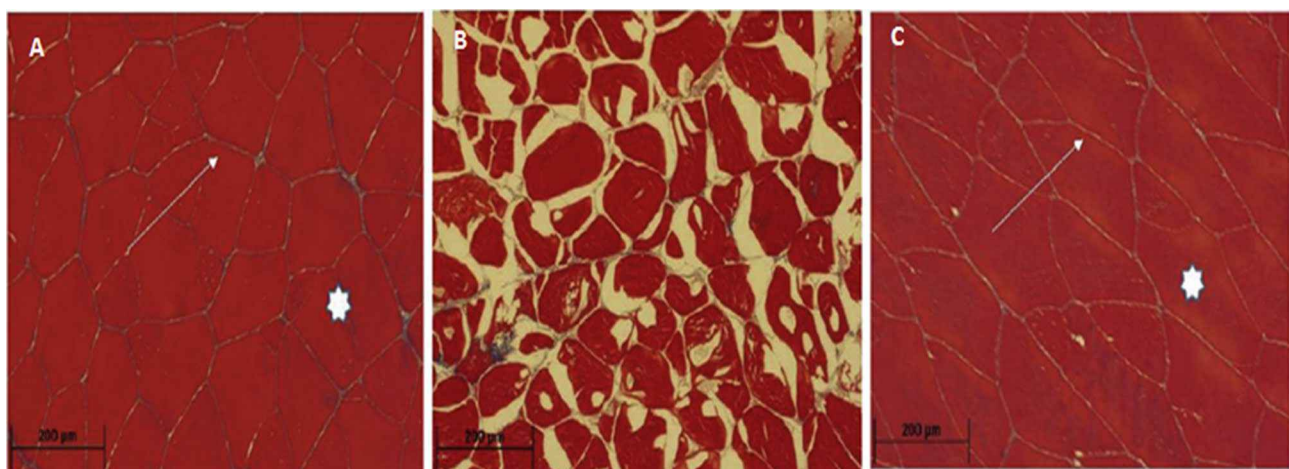
Fig. 4 Comparison between A fresh muscle tissue, B tissue after 3-h isobaric preservation at -5 °C, and C tissue after 3-h isochoric preservation at -5 °C [30]

Isochoric cryopreservation can tolerate liquid nitrogen temperatures and pressures ranging up to 413 MPa, explaining that pressure measurement is crucial for the control of vitrification and devitrification in aqueous solutions [35].