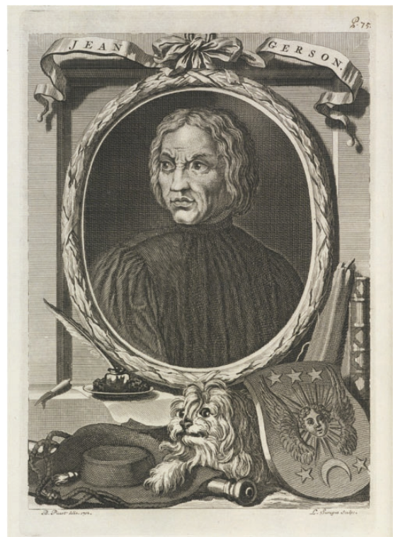
Figure 3. Jean Gerson (1363–1429), French scholar, educator, reformer, and Chancellor of the University of Paris. Gerson's skepticism can be sensed in three of his texts: 1402 De distinctione verarum revelationum a falsis . [On distinguishing true from false revelations]. 1415 De probatione spirituum . [On testing the spirit] 1423 De examinatione doctrinarum . [On the examination of doctrines]. The portrait is a 1714 engraving by Bernard Picart.

Gerson was preoccupied with finding ways to distinguish genuine divine revelations from trickery. His texts (Figure 3) do not simply convey a wish to expose deceptive individuals, however. Rather, they provide clear instructions for being a rational sceptic,