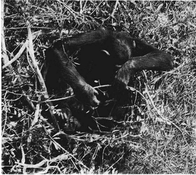
Fig. 3. Shadow builds a nest on the ground from fresh leafy branches.

any other diad in the group. Shadow and Bandit, Gigi and Shadow, and Shadow and Belle all slept together infrequently but played together often. Finally, there was no significant correlation for sleeping partners and duration of play bouts ( n = 15 , r_s = 0.30 , p > 0.10 ).